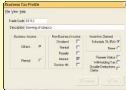
Client profiles make it easier for inexperienced staff by filtering out worksheets and lampirans there are not applicable.